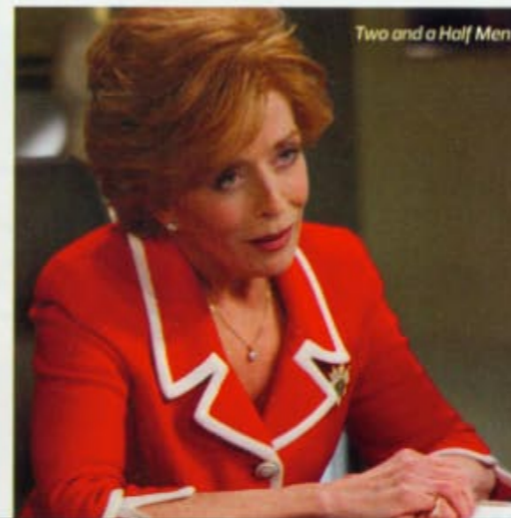
Two and a Half Men