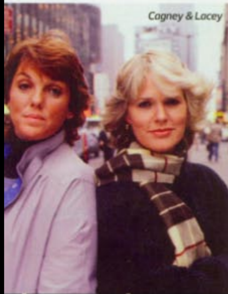
Cagney & Lacey