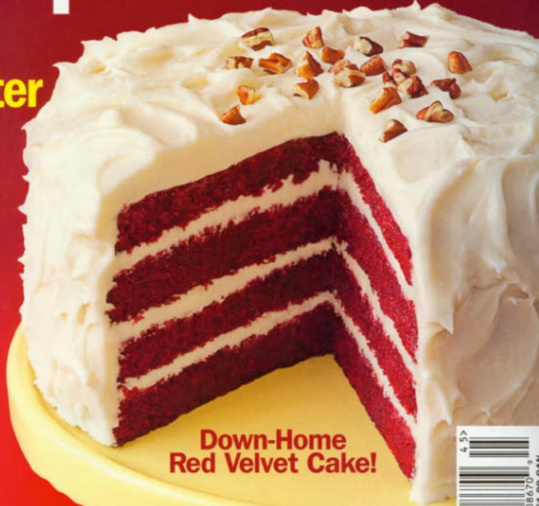
Down-Home Red Velvet Cake!